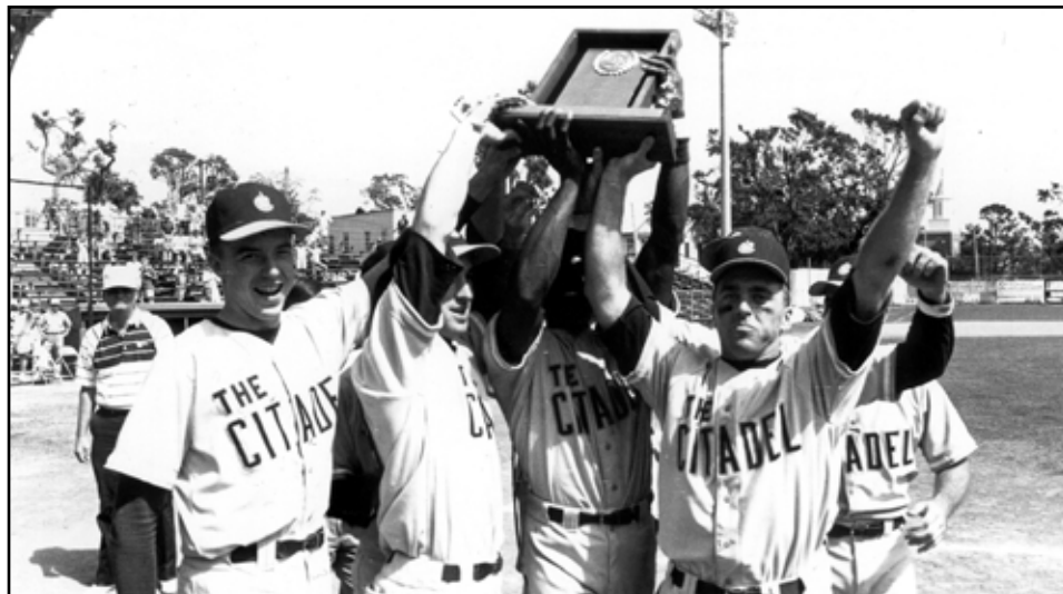
The Citadel's 1990 squad made a memorable run to the College World Series in Omaha, Neb.

Mississippi State 7, EAST TENNESSEE STATE 6 EAST TENNESSEE STATE 2, Clemson 1 EAST TENNESSEE STATE 5, Wichita State 4 Mississippi State 6, EAST TENNESSEE STATE 5