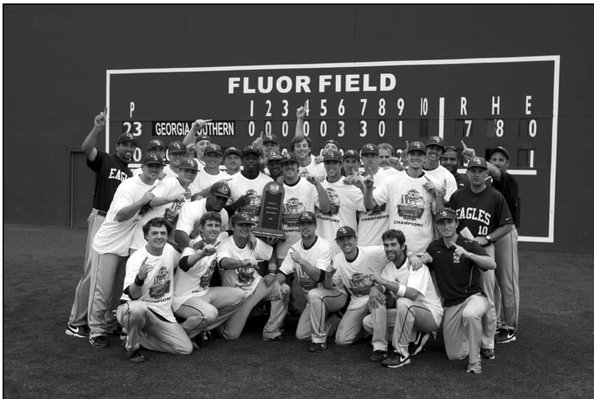
After finishing second to Elon in the regular season, Georgia Southern defeated the No. 1 seed Phoenix, 7-3, to win the 2009 SoCon Baseball Championship at Fluor Field in Greenville, S.C.